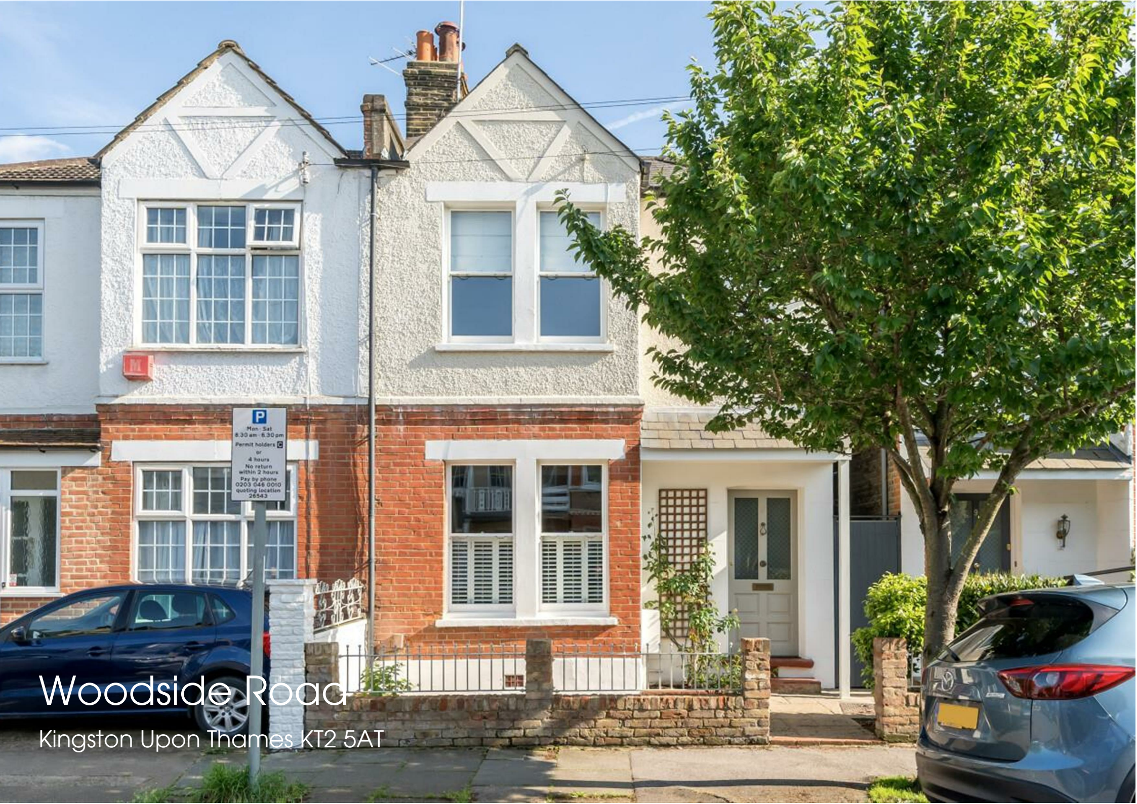
Woodside Road Kingston Upon Thames KT2 5AT